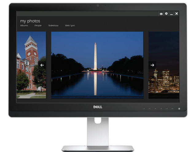
Dell UltraSharp 23 Multimedia Monitor | UZ2315H 58.42 cm (23 inches)