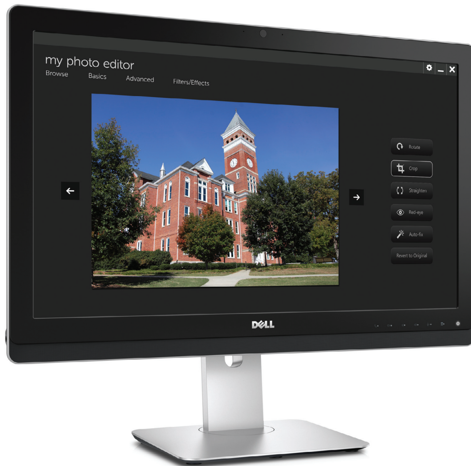
Dell UltraSharp 23 Multimedia Monitor | UZ2315H 58.42 cm (23 inches)